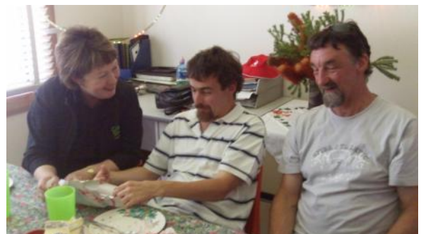
Adult House enjoying a Christmas Lunch